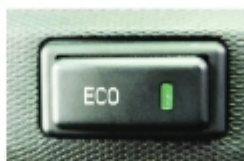
Eco Switch (Petrol Model)