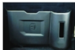
Bottle & Document Holder