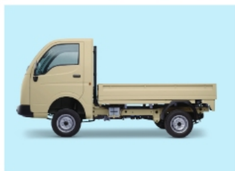
Cabin Load Body